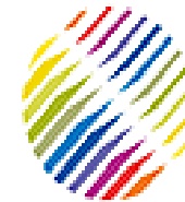
European Research Area